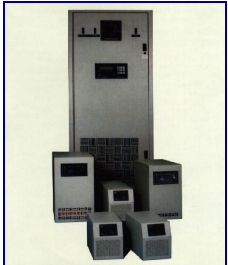
The family of Mesta UPS...Series I(.4 to 1.25 KVA), the 2 to 5 KVA Series II and the three-phase Series III systems.

❑ The first single-conversion, continuously on-line-interactive UPS. Because the Mesta unit is on-line , it co-exists with your AC line input and continuously responds to line spikes and drops. And, because it is single-conversion , it is twice as efficient as antiquated double-conversion designs. Finally, because it is interactive , it continuously responds to the AC line input and the load to enhance the power factor and minimize the demand. This results in continuous protection, power conditioning and high efficiency.