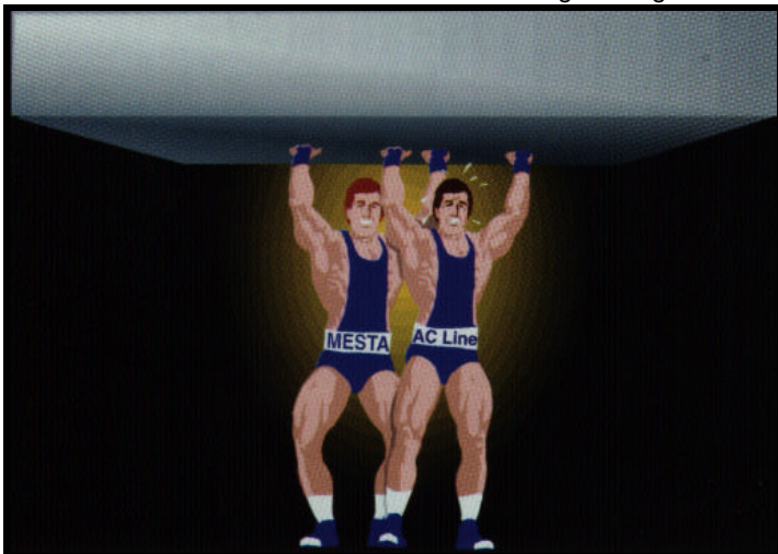
The Mesta UPS output co-exists: with the utility. It is on-line and interacts with the AC line by complementing or assuming the load as necessary.

These advanced engineering features are standard on every Mesta UPS...from the streamlined Series I (0.4 KVA) to the ultra-programmable Series III (three-phase systems). All made in the USA.